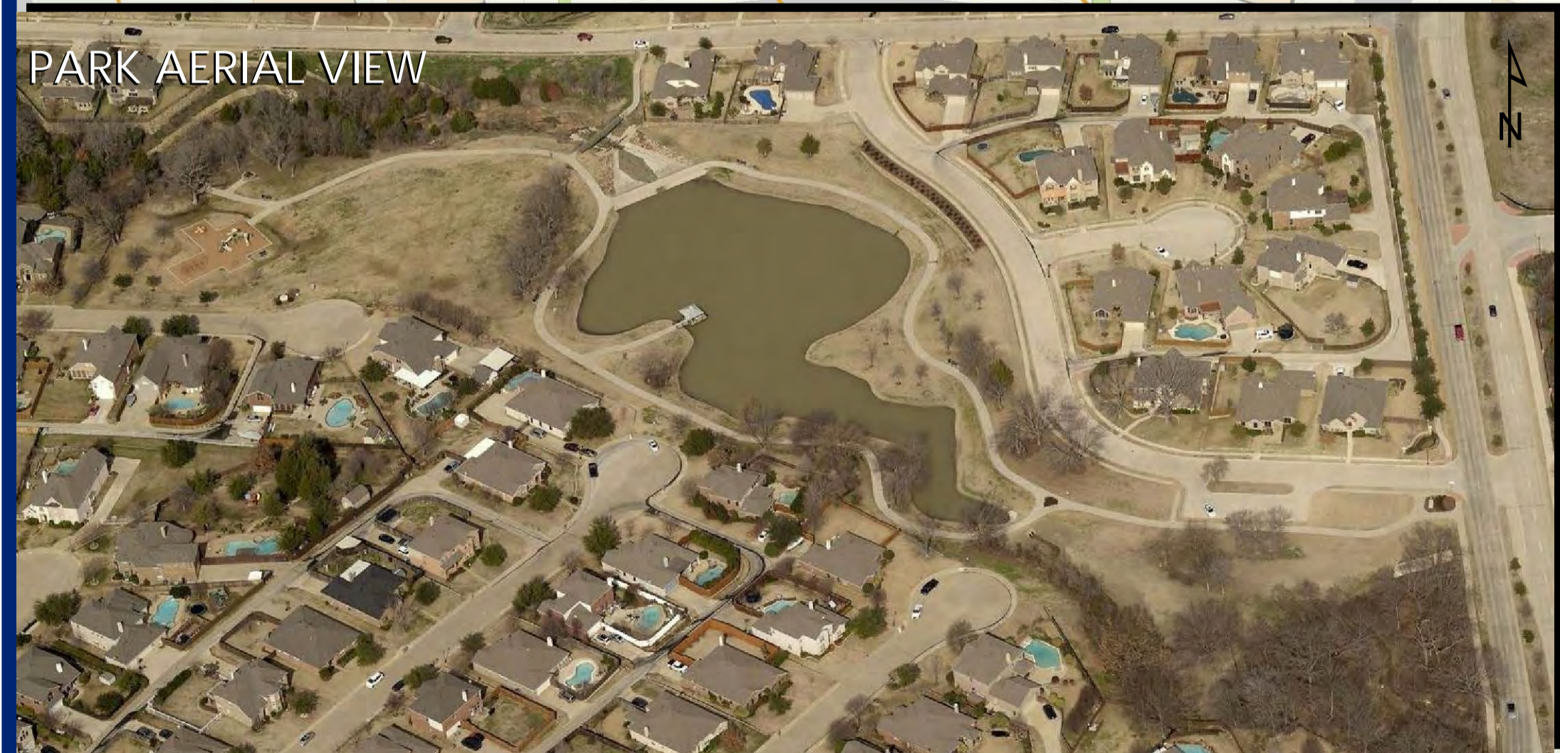
PARK AERIAL VIEW